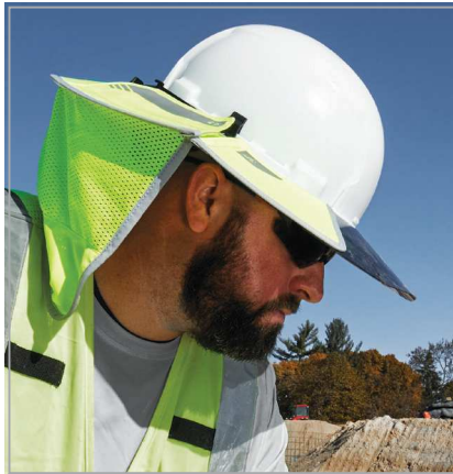
BOLT™ Sun Visor w/ Sunshade 48-73-1072