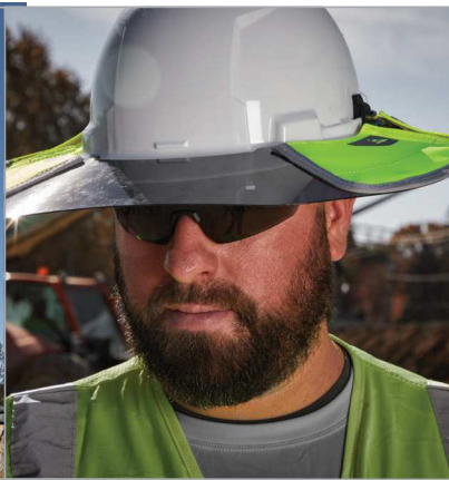
BOLT™ Sun Visor 48-73-1073